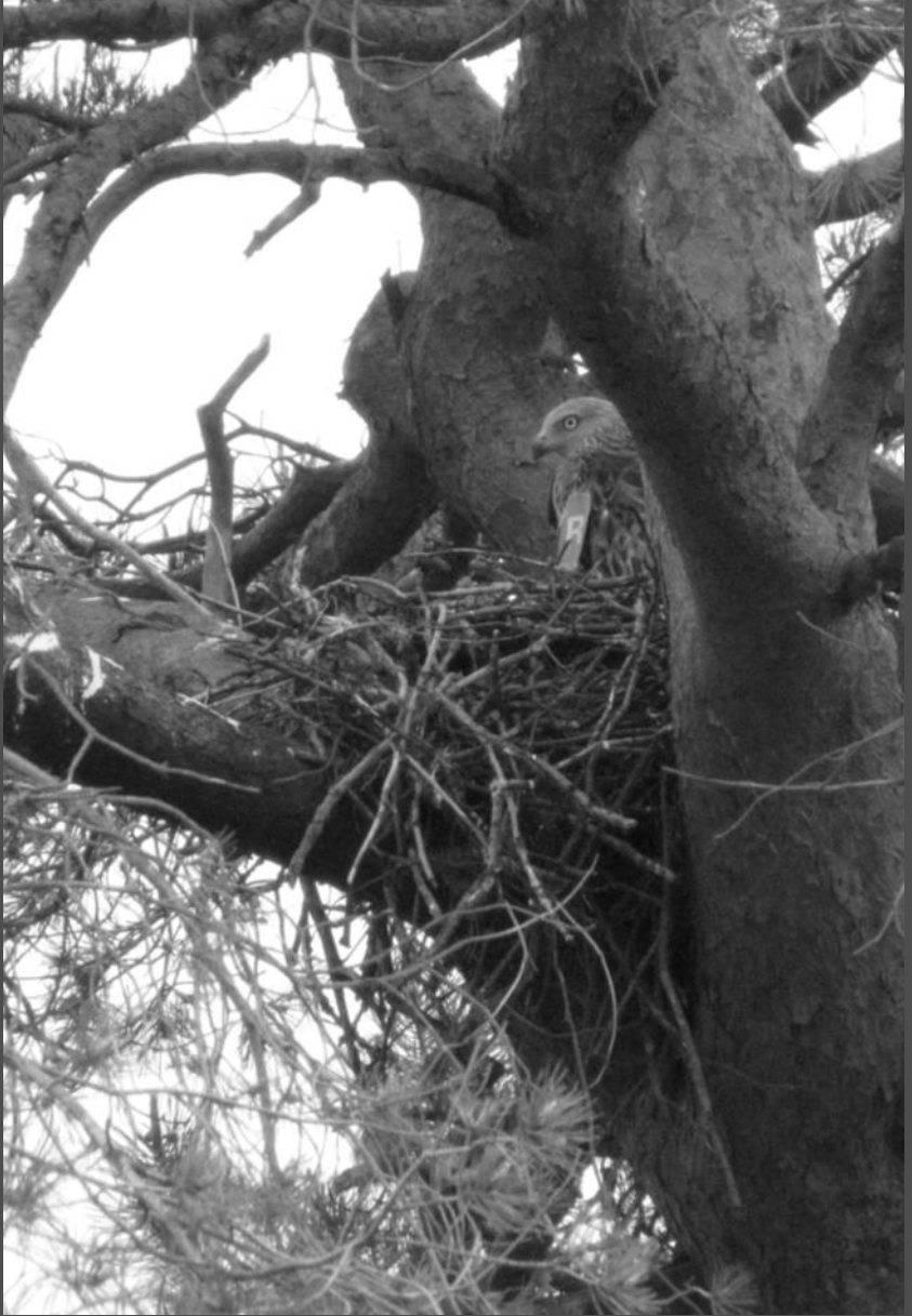
Green/yellow R, 2004 female on her nest at site 5